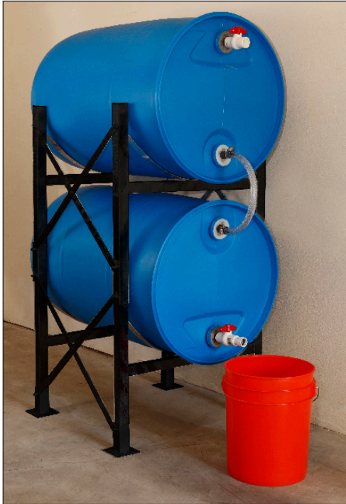
Welded Construction / Powder-Coated Racking

Clean Water Storage that's Simple to Install and Easily Accessible