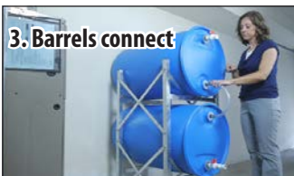
3. Barrels connect