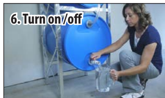
6. Turn on/off