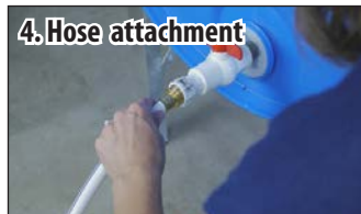
4. Hose attachment