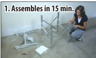
1. Assembles in 15 min.